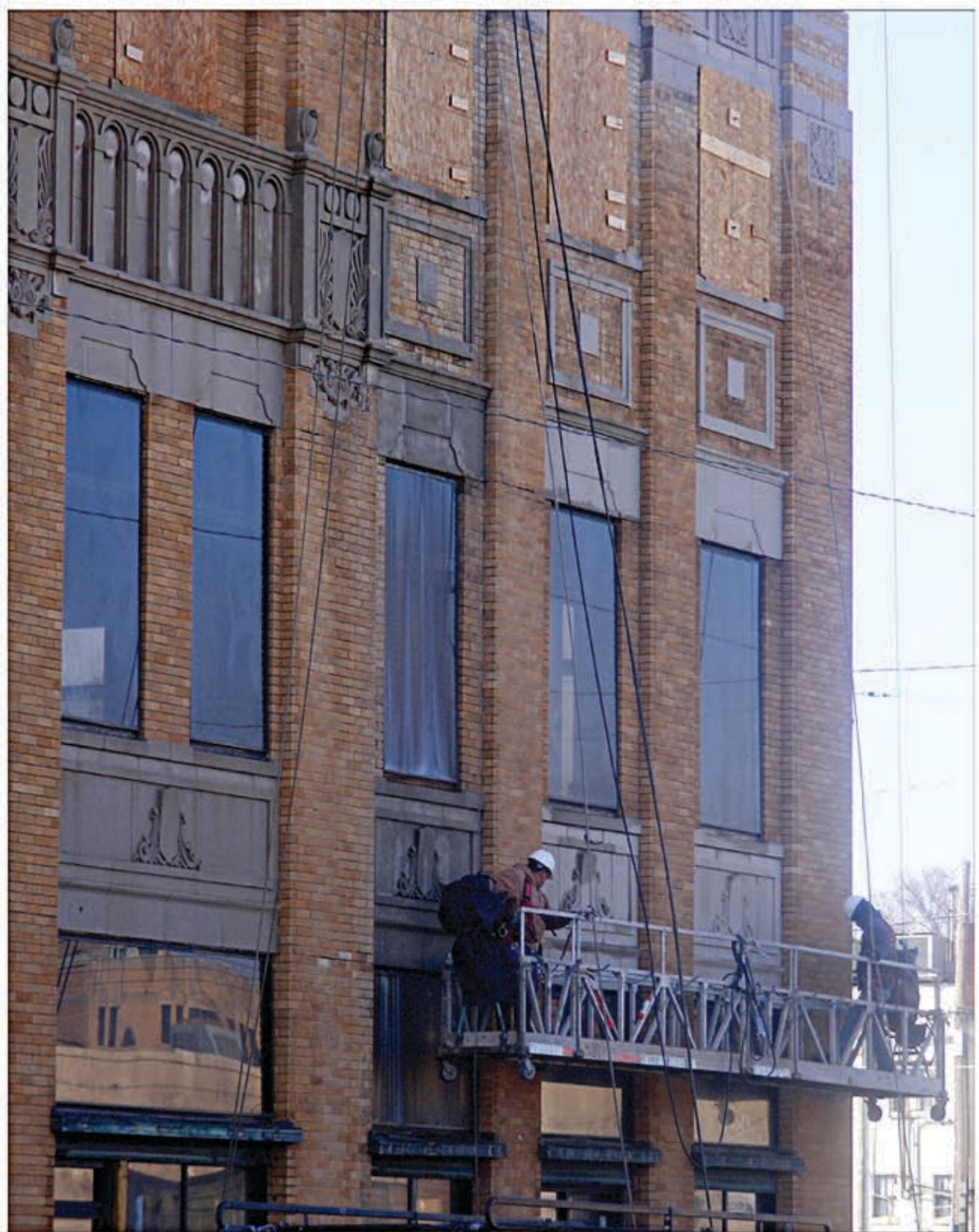
Crews from D&S Construction use a scaffold as they perform renovation work on the exterior of the Settles Hotel Friday morning.