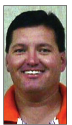
District 4 Kennedy