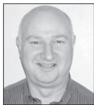
By Eddy Pitchford

School is back in session. Family routines and schedules seem back in place. Evenings include homework and discussions about school. Morning prayers are offered in behalf of attitudes and examples in the classroom.